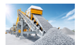
Stone Crushers/ Blue Metals