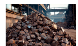
Iron Ore Movement